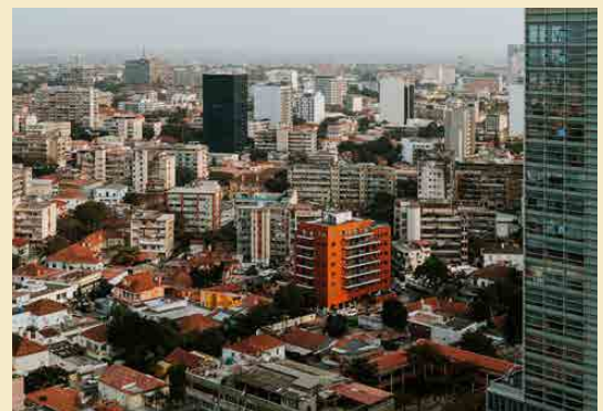
Luanda is the capital of Angola, with 2.6 million residents.