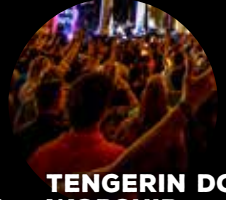
TENGERIN DOO WORSHIP