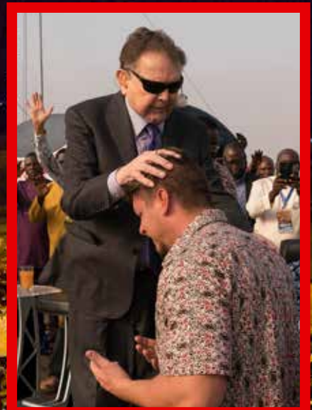
Praying with hundreds of thousands of intercessors

And numerous churches in the areas closest to the campaign field have joined together since then to hold giant prayer meetings on the field every week. People are pouring in to these meetings, because of the many stories they keep hearing of miracles and healings that are still taking place there.