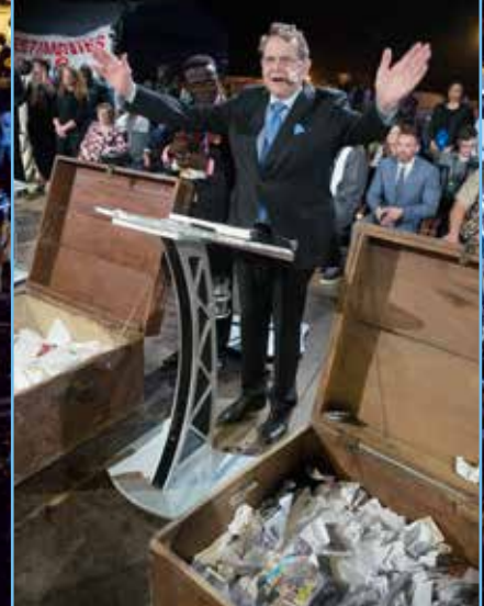
Together with the pastors, the spiritual leaders and the entire crowd, we prayed for the requests that filled two big boxes. These were the thousands of prayer requests that were sent to CfaN offices worldwide during the last prayer intervention.