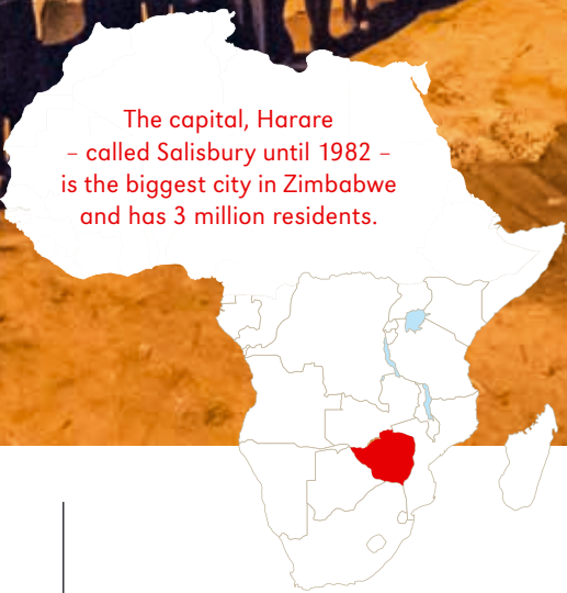
The capital, Harare – called Salisbury until 1982 – is the biggest city in Zimbabwe and has 3 million residents.