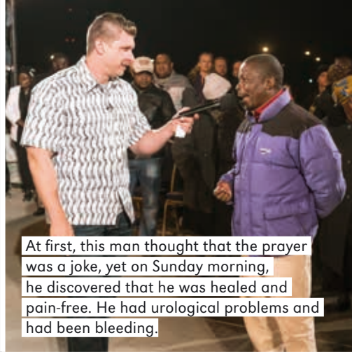
At first, this man thought that the prayer was a joke, yet on Sunday morning, he discovered that he was healed and pain-free. He had urological problems and had been bleeding.