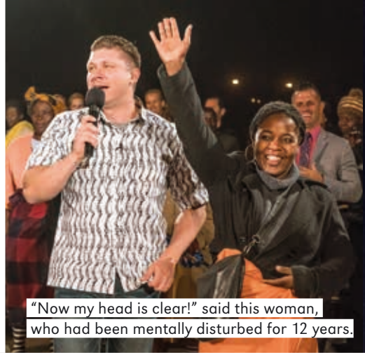
"Now my head is clear!" said this woman, who had been mentally disturbed for 12 years.