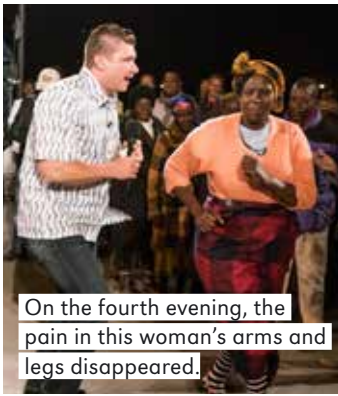
On the fourth evening, the pain in this woman's arms and legs disappeared.