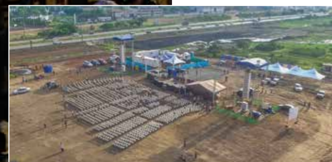
The former rubbish dump – prepared for the CfaN Fire Conference each morning.

The hard work paid off. About 90,000 people came to the first meeting.