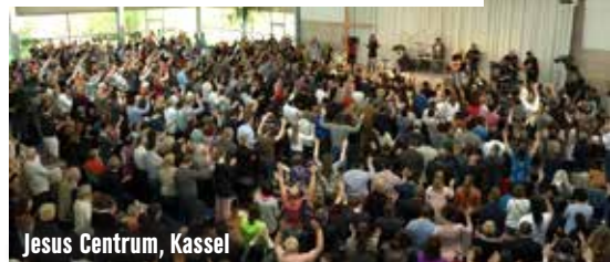
Jesus Centrum, Kassel