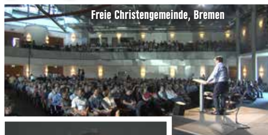
Freie Christengemeinde, Bremen