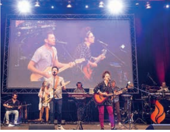
Worship band from "King of Kings" congregation in Jerusalem