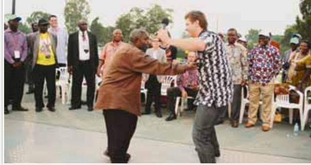
A man who had been totally blind for three years joyfully testified that he could see again.