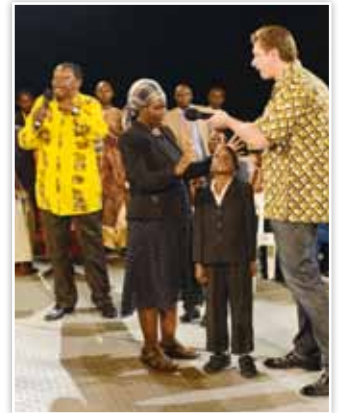
A mother brought her son who was born with a hole in his neck. After prayer, she said the hole vanished.

stopped! A few minutes later, the skies were clear and the sun was shining. They finished the whole service without interruption.