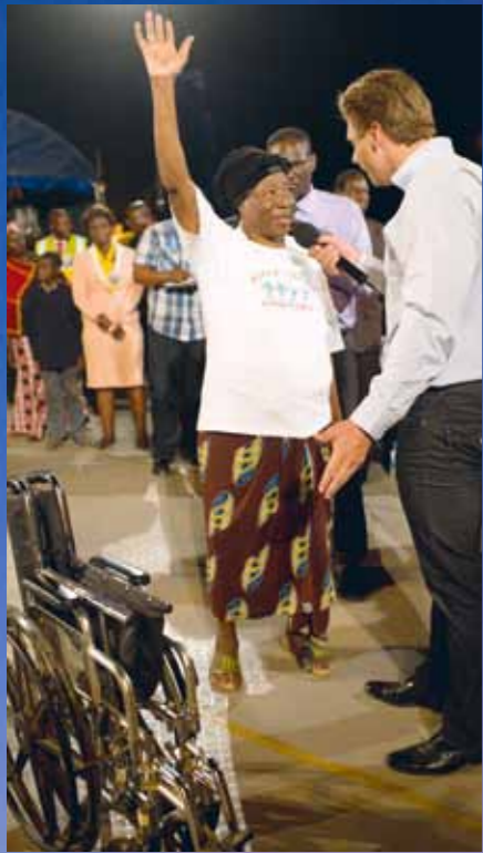
For two years this woman sat in a wheelchair, unable to walk. But Jesus Christ healed her on the third day in Lusaka.