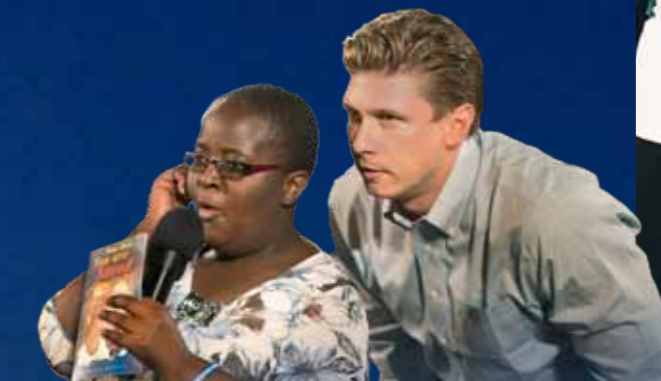
A woman totally deaf in her right ear was completely healed.