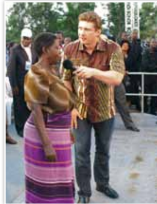
A woman who was deaf for 46 years was totally healed on the third day. Her pastor came with her and attested to the amazing miracle!