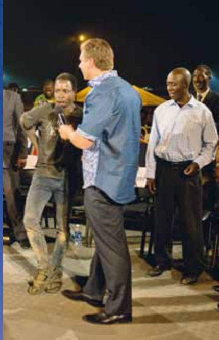
As we prayed, a mad man who sat on the ground eating dirt suddenly came to his right mind. When he came on the platform, he was covered in dust from head to toe. But he declared the wonders of God with such enthusiasm, one pastor on the platform said, "He's preaching!" The people were beside themselves with joy! It was like something right out of the New Testament.