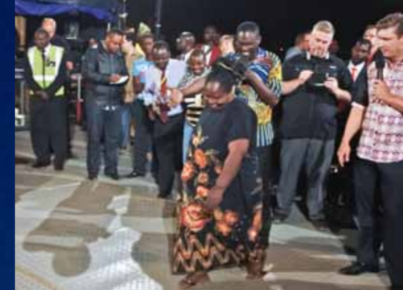
This woman was unable to walk, so people had to carry her to the Campaign meeting. But she testified that, after receiving prayer, she could walk perfectly.