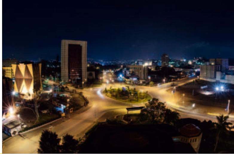
Cameroon is roughly the size of Germany, Austria and Switzerland put together.