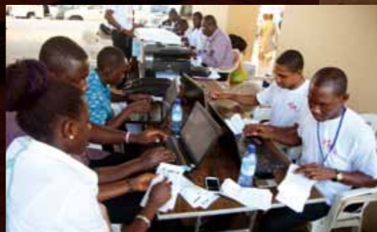
Effective follow-up work: The decision cards completed in Accra were immediately recorded by computer and a text message was sent to more than 20,000 respondents just a few hours later.

proclaim the Gospel in the manner described by Paul in 1 Corinthians 2:4-5: "My message and my preaching were not with wise and persuasive words, but with a demonstration of the Spirit's power , so that your faith might not rest on men's wisdom."