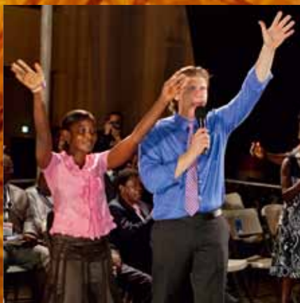
This young woman had suffered from constant bleeding for three months. As she came to the meeting, her problem vanished.