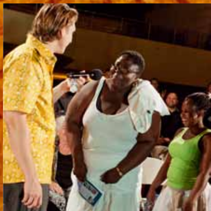
This woman had a painful breast tumor . On the second evening she was totally healed, the lump disappeared and all pain left.