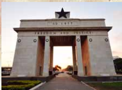
Black Star Gate, symbolizing Ghana's independence, was right next to the campaign site.